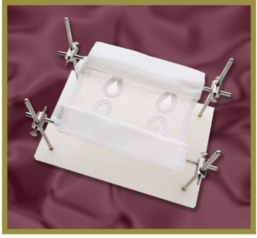
Sold separately-Randall Selitto test