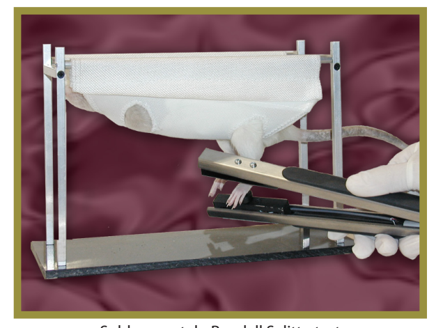
Sold separately-Randall Selitto test

Order any one of the test systems complete and the only additional item(s) needed are the individual modules to perform each test.